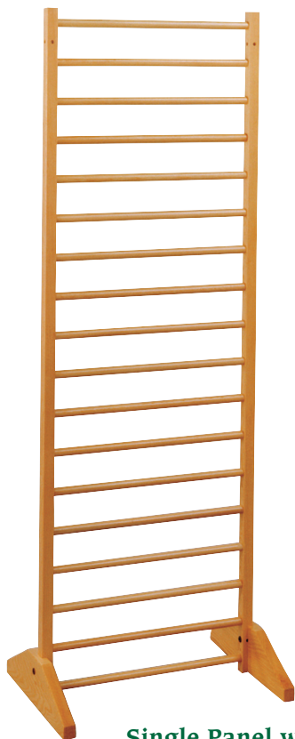
Single Panel w/(2) Feet