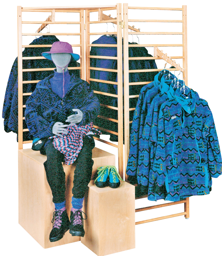
Z-Rack w/Faceouts & Triangular Shelf

(4) 24" W "A" Panels 48" D x 48" W Heights: 51", 59", 71", 83"